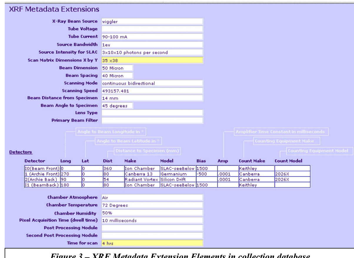
Figure 3 – XRF Metadata Extension Elements in collection database

The XRF imaging of the Archimedes Palimpsest required a unique set of metadata extensions to capture the new data elements for different imaging techniques, energy levels and data formats. With no scanning XRF imaging standards available in the XRF literature, the team created a draft set of metadata extensions. These were incorporated into a collection database prior to the first XRF imaging session. The XRF imaging team then refined the additional metadata elements in a dynamic process, while entering data during 24-hour imaging sessions lasting up to 12 days. The numerous variables in position around the manuscript, high energy levels and elemental information had not been anticipated during the early optical imaging phases of the program, requiring significant additional metadata in the XRF Extensions (as excerpted from the collection database in Figure 3). The XRF team reviewed the metadata elements and updated the current draft of the Archimedes Palimpsest Metadata Standard XRF Extensions at the end of the imaging This standard is also available for broader review on the session [12]. archimedespalimpsest.org website.