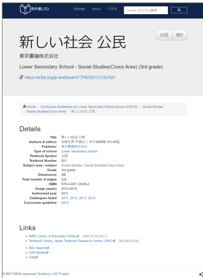
(a) Example of a textbook page

@prefix textbook: <https://w3id.org/jp-textbook/>. @prefix bf: <http://id.loc.gov/ontologies/bibframe/>. @prefix schema: <http://schema.org/>. @prefix rdfs: <http://www.w3.org/2000/01/rdf-schema#>.