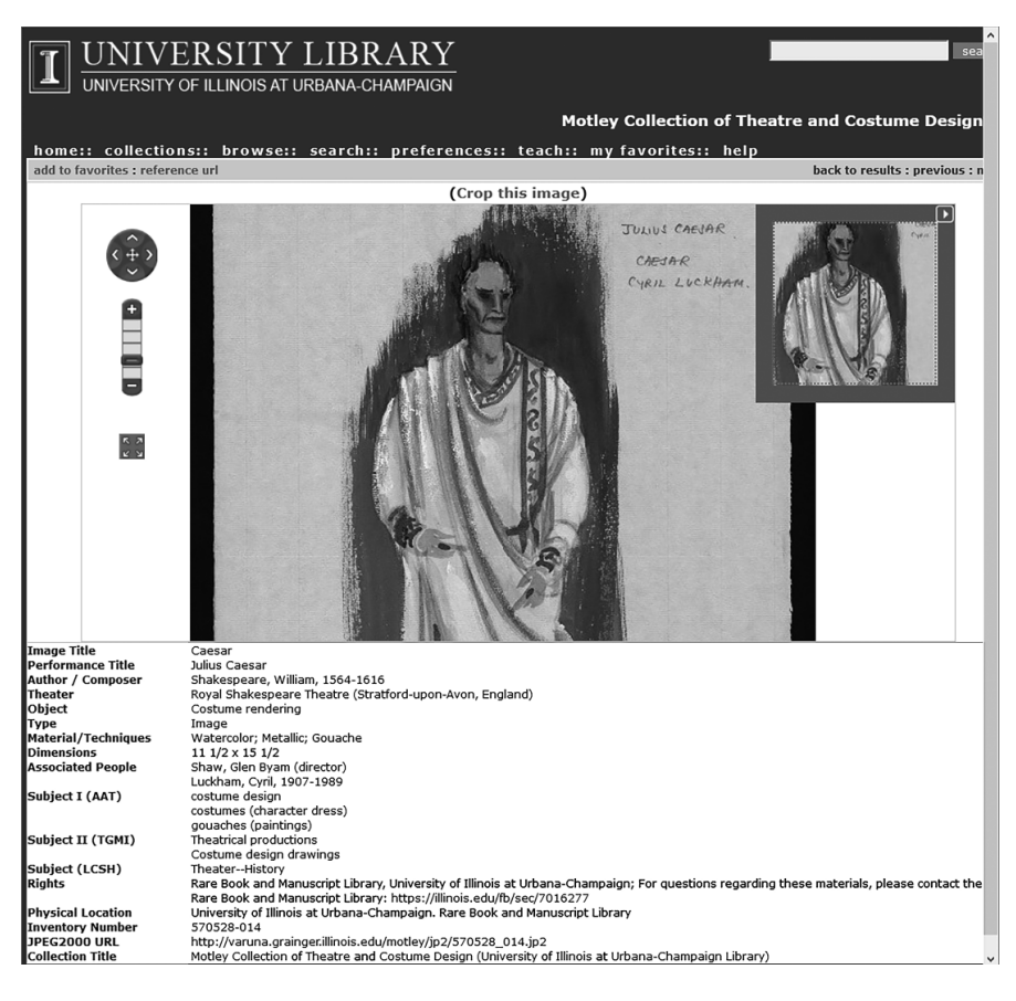
FIG 1. Digitized costume sketch from Motley Collection with original metadata.

Carefully mapping the Motley collection's legacy metadata model into the schema.org vocabulary (and any other linked-data-compliant vocabulary) begins by identifying these 1-to-1 violations in the existing metadata records. The resulting metadata records can then be divided into multi-part accounts that provide information particular to the different individual entities. Distinguishing the entities described is an essential first step in mapping legacy metadata into schema.org semantics and useful LOD-compatible descriptions. However, simply isolating and mapping the various entities described in the legacy metadata is not sufficient to make the metadata account optimal when displaying descriptions to users of these collections. The snippets of legacy metadata describing these additional entities must be enriched through the addition of links to external LOD services and other external resources (as described in Section 3 below).