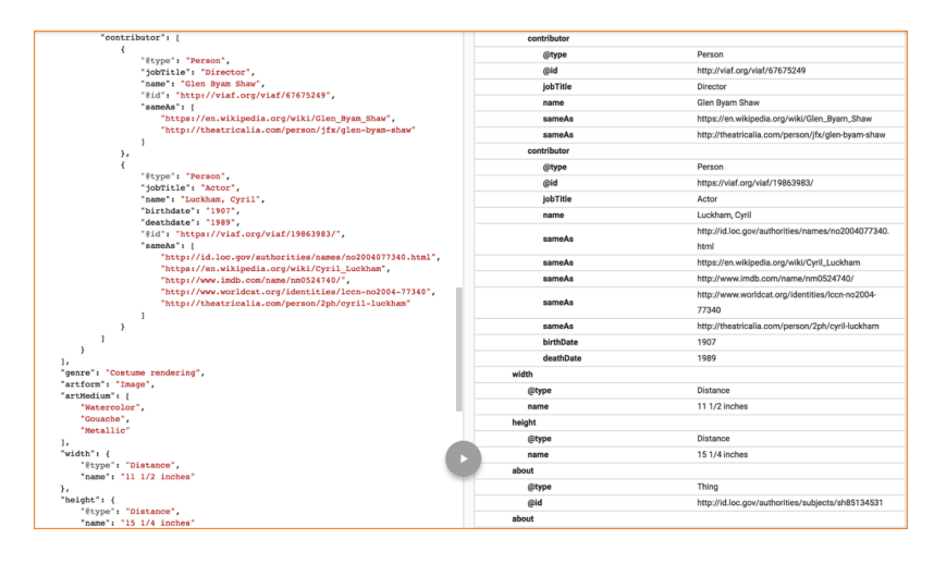
FIG. 3. Snippet of item-level RDF serialized in JSON-LD and viewed in Google Structured Data Testing Tool

Transforming the structure of item-level metadata to better align with RDF and LOD best practices makes it easier for LOD-based applications to consume these resource descriptions; in theory, this should facilitate discovery. Similarly, including links to related Web resources and to LOD-based repositories containing additional information provides an opportunity to enhance user interaction with digitized special collections. While it is too early on this project to assess whether discovery of Motley resources (LOD-compatible metadata was only added to resource pages in late spring), work with the Google Structured Data Testing Tool (Figure 3) is encouraging.