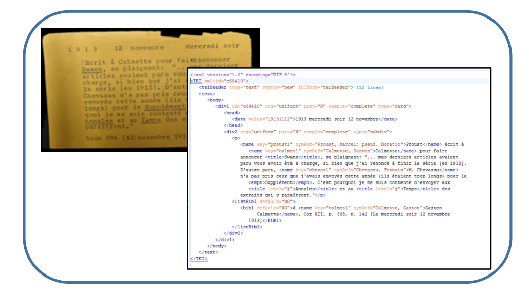
FIG. 2. A card from the KPA and its TEI transcription.

In this case the recognition of how to proceed finally arrived when we realized that each of Prof. Kolb's transcribed notecards could be represented using the schema:DataSet class which is a subclass of schema:CreativeWork. This approach allowed us to accomplish three important things: