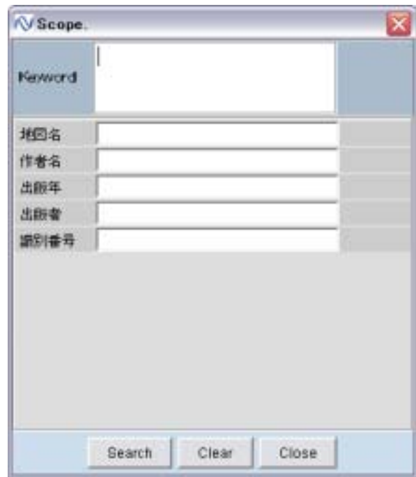
Figure 4. Search Window

The metadata information can be browsed not only by selecting from the left window but also by searching metadata using specific terms in the search window. For searching, first you have to open a search window using the iPalletnexus menu bar. (Figure 4) The Search window contains forms such as Title, Publisher, Date and Identifier that correspond to Dublin Core format. Then you have to enter a keyword in this form and press the search button. A list of metadata containing relevant information is displayed in a new window. You can find a map image by clicking on the displayed metadata. Also, if you want to search about Part B and C, enter the keywords in the Keyword form. The keyword form and the forms such as Title, Publisher, date and Identifier can be conducted simultaneously “and” searched leaving a high accuracy for refinement of resources. A term can be searched for in either the Japanese or the English language.