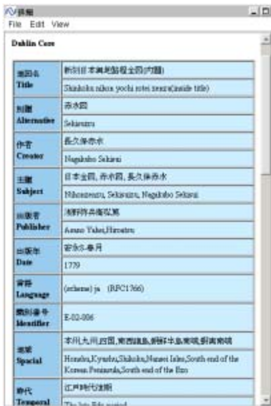
Figure 3. Metadata Window

By creating an XML-format metadata as described in Section 4 and correlating it with a Pal file image as described in Section 2, relevant image and a list of metadata are displayed in the left window of iPalletnexus. By clicking on an icon on the left window, user can open the metadata window on the right side, with metadata stored by the Dublin Core of Part A being displayed in Japanese and English (Figure 3). Also, by clicking on the detail icon on the left tree window, “B. Information on the object” and “C. Detailed information on digital data” will be displayed additionally in the metadata window. Displaying only the Dublin Core part in Part A is sufficient for general use. However, if information for academic research or for digital data control is required, displaying Part B and C allows covering from the basics to specialized use of a single metadata file.