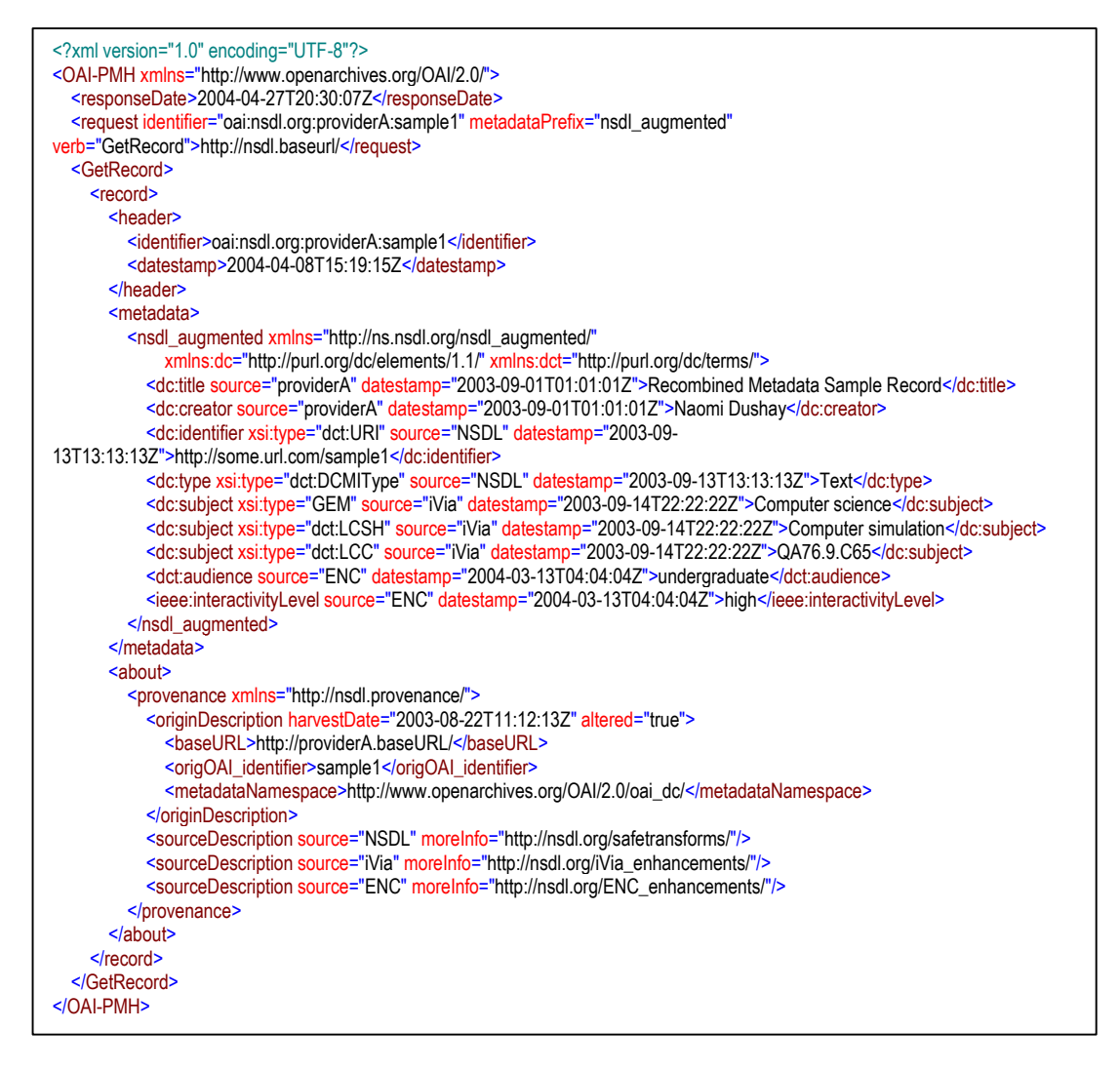
Figure 2-- An augmented metadata record in a preliminary format