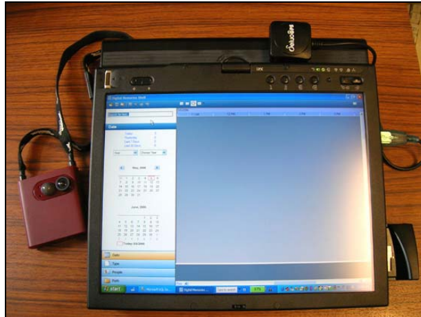
Figure 1: M 2 SenseCam (left) and MLB Calendar Display

It is important to note that we are exploring the use of technology and metadata to support students' memory and reflection. We are leaving aside, for now, the key issue of privacy, which introduces many complex legal and social issues—and require separate in-depth research.