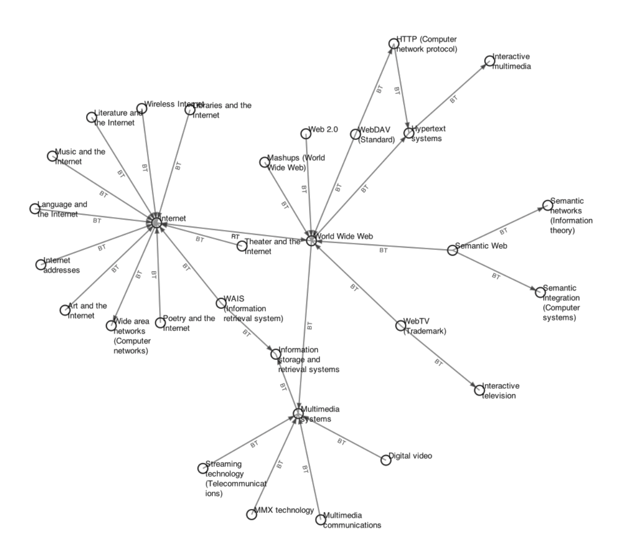
FIG. 2. Semantic Relationships between Concepts.

Proc. Int'l Conf. on Dublin Core and Metadata Applications 2008