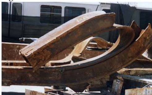
Figure 4. Vehicles in the WTC Archive