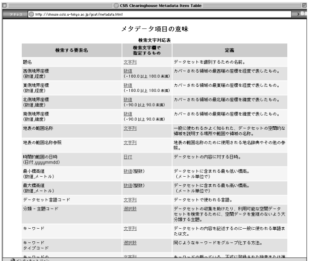
Figure 4. Description for items in metadata.