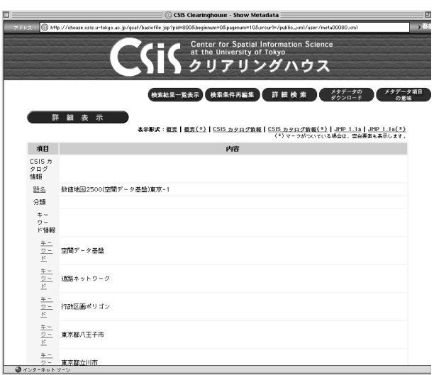
Figure 3. An example of the content of a metadata in a table style display format.