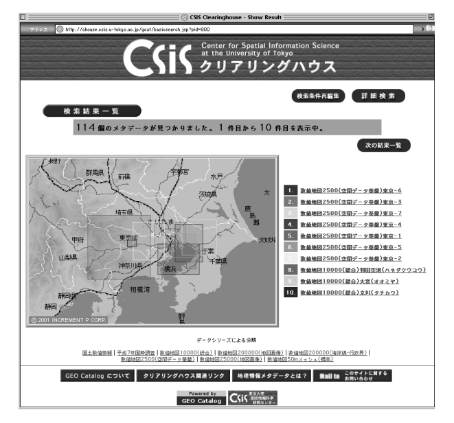
Figure 2. A result of selecting an area of interest.